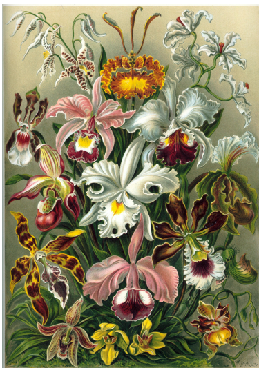
Colour plate from Ernst Haeckel's Kunstformen der Natur

who grows, yes, more beautiful because one of us will die